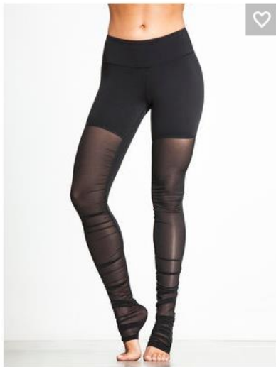
ALO YOGA MESH GODDESS LEGGING

Most of celebrities combine different pieces of clothing like slim leggings or workout tights with zipped hoodies in many colors. Most of times there sneakers are going to be either in neon or bright yellow color which look awesome. Many people undermine the role of carbon 38 workout clothesbut they play very important role in giving a nice trendy look and provide great comfort too. After all, who doesn't want to carry a polished and perfect look for yoga class or pilates?