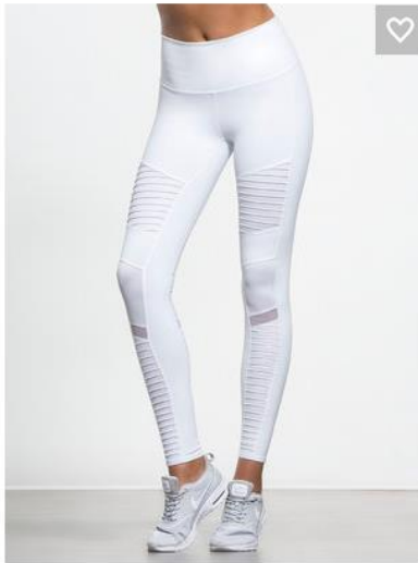
ALO YOGA HIGH WAISTED MOTO LEGGING