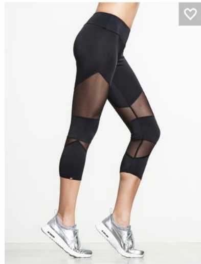
ONZIE CUT OUT CAPRI